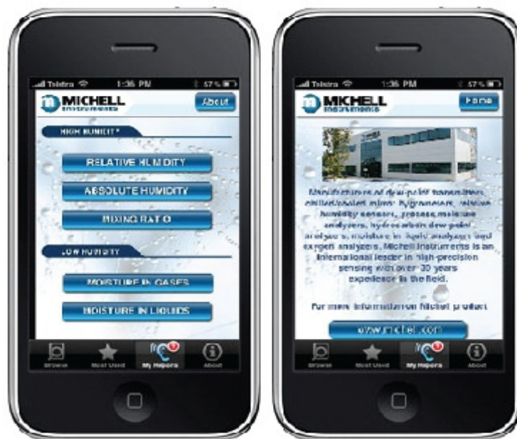
Main Menu Info Screen