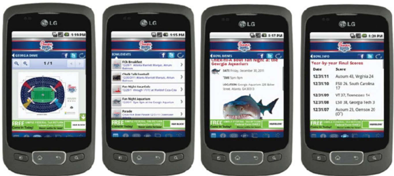
Fan Application with Events, Photos and Video Screens