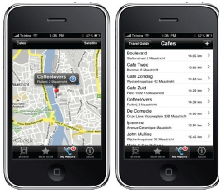
Map View Listing of Cafes