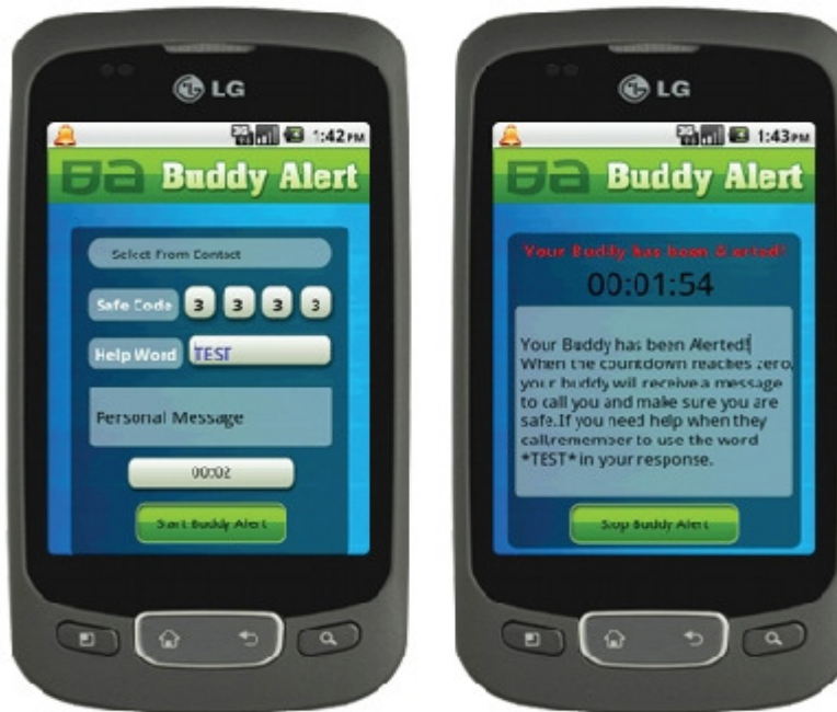
Message Alert Screens