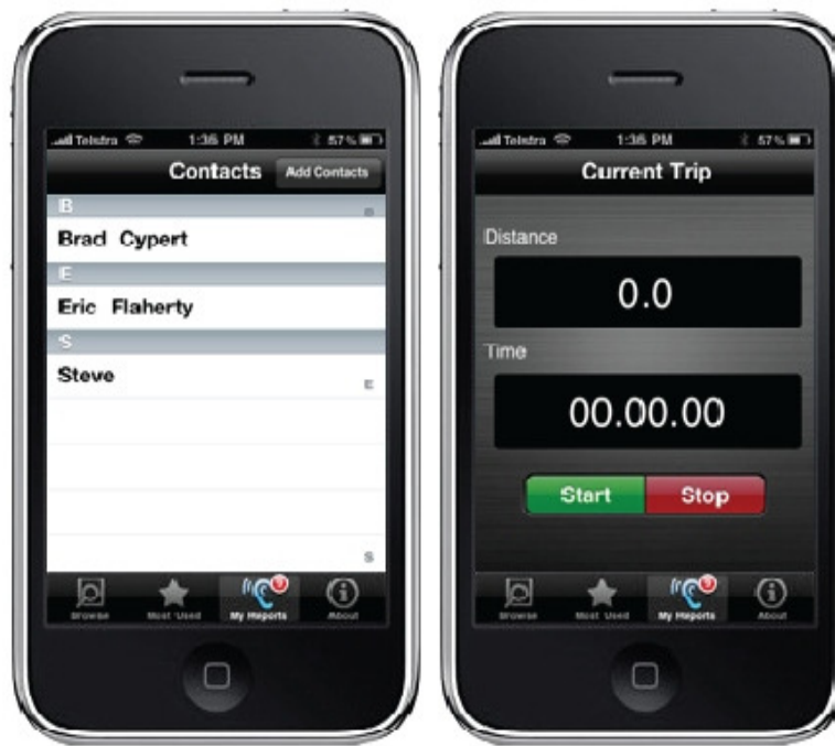
Contact List Distance and Time (meter showing for the current trip)